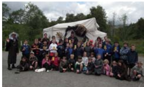
School kids enjoying 'Honey' by Pif - Paf Theatre

Headed up by Voluntary Action Badenoch and Strathspey (VABS), the project aims to stimulate local business and entrepreneurship by making sure communities have skills in things like business planning, marketing and communications. Community groups will hopefully gain the confidence to consider