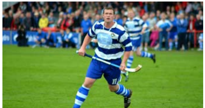
Game of shinty

Further information on the Cairngorms Local Action Group and LEADER funding in the Cairngorms National Park can be found at www.cairngorms-leader.org