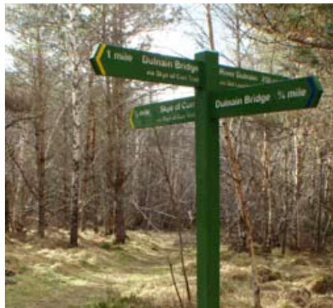
Dulnain Bridge Signs