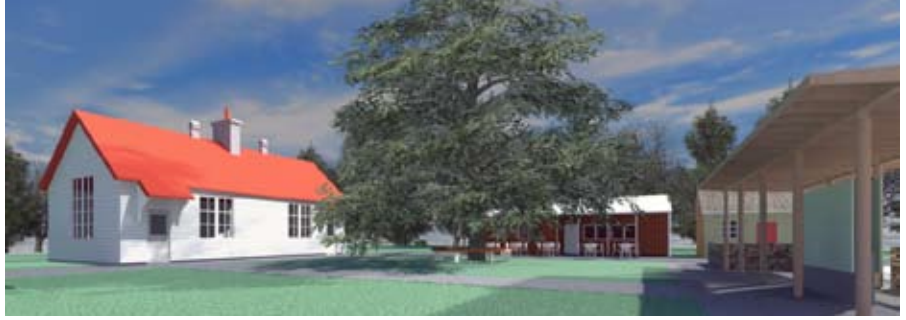
Blair Atholl Ranger Base Architects Drawing

open in July and will provide information, interpretation and education for visitors to Atholl and the National Park. It will also be home to Atholl Estates Ranger Service.